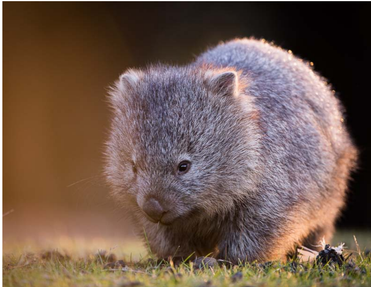
Top: There's a high chance that you'll get to encounter wombats on your walk

The first two nights of the walk are spent 'glamping' at the wilderness camps with permanent tents, comfy beds and sleeping bags provided. There are private showering and toilet facilities as well as a dining tent and sitting area in which to relax. The campsites are nestled in the bush and situated near secluded beaches. The final