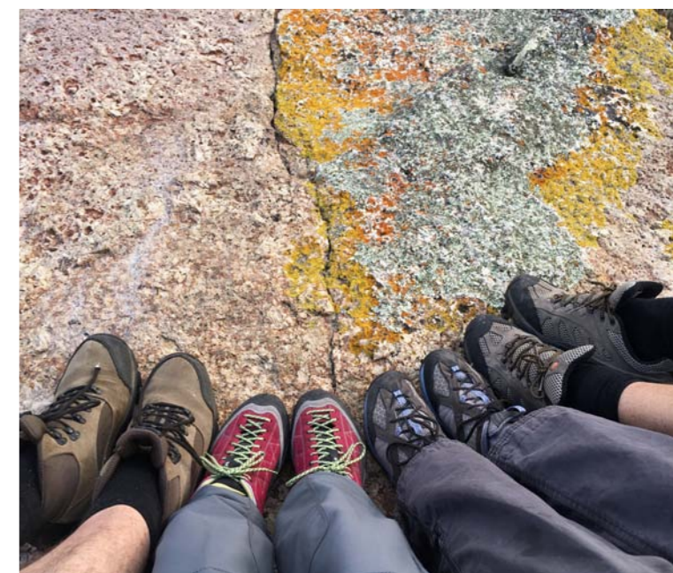
Clockwise from opposite: Walk along Reidle Beach