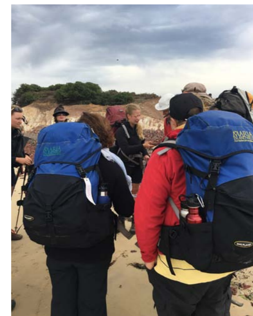
Guests are provided with packs but carry their own, unless pre-arranged