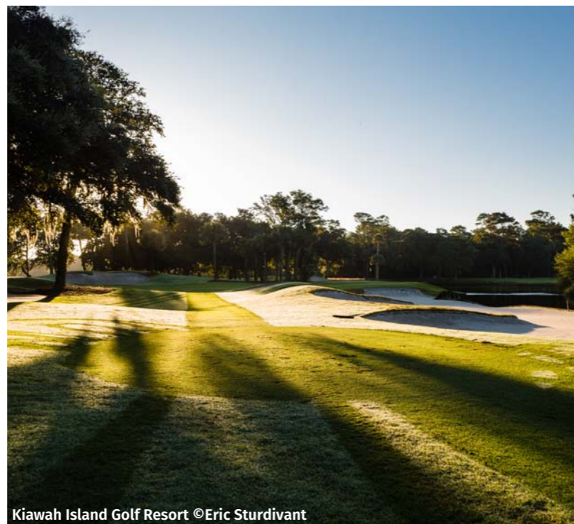
Kiawah Island Golf Resort

The global mecca for golf courses is the United States, claiming close to half of all official golf courses in the world. There are many great places to play, but we would advise not passing up the chance to play in South Carolina. Located on the south-east coast, the courses here are peppered with interestingly shaped lakes and challenging sand traps. If in town, have a few drives at the coastal Kiawah Island Golf Resort, a stunningly difficult configuration with tricky slopes on the greens and strong Atlantic winds guaranteed to play havoc with your tee shots.