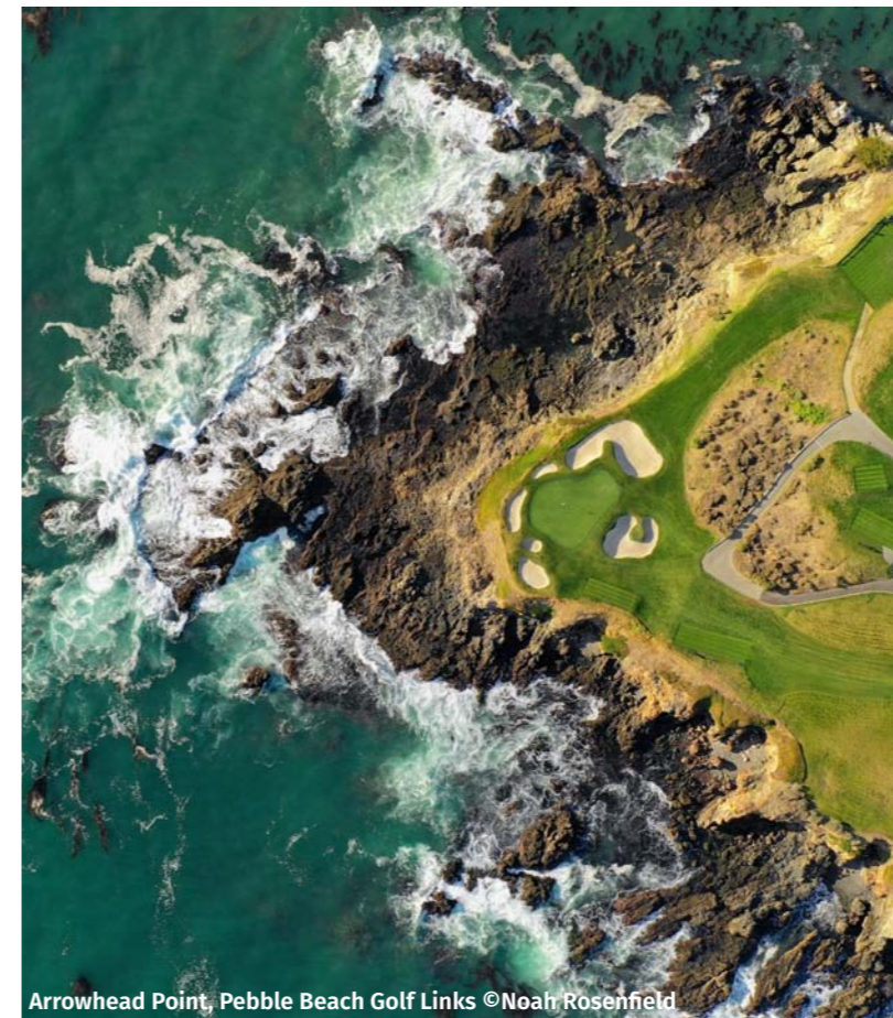
Arrowhead Point, Pebble Beach Golf Links